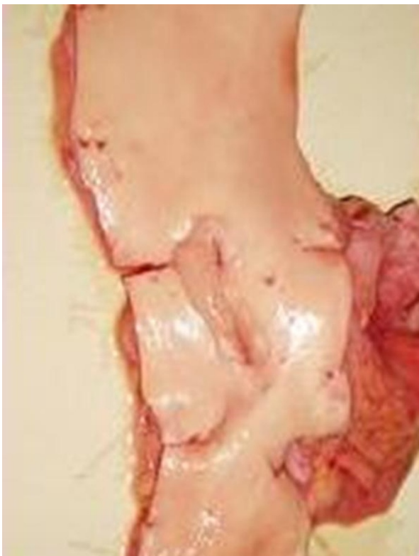
Figure 2 Macroscopic picture showing origin of coeliac trunk and superior mesenteric artery.

with loss of smooth muscle and a proliferation of elastic tissue [Figure 1]. The nature of the lesion was confirmed as intimal fibro muscular dysplasia and thrombosis causing stenosis and subsequent occlusion of the origin of superior mesenteric and celiac artery [Figure 2]. Intimal fibro muscular dysplasia of aorta causing stenosis of the origin of superior mesenteric and celiac artery was rare in medical literature.