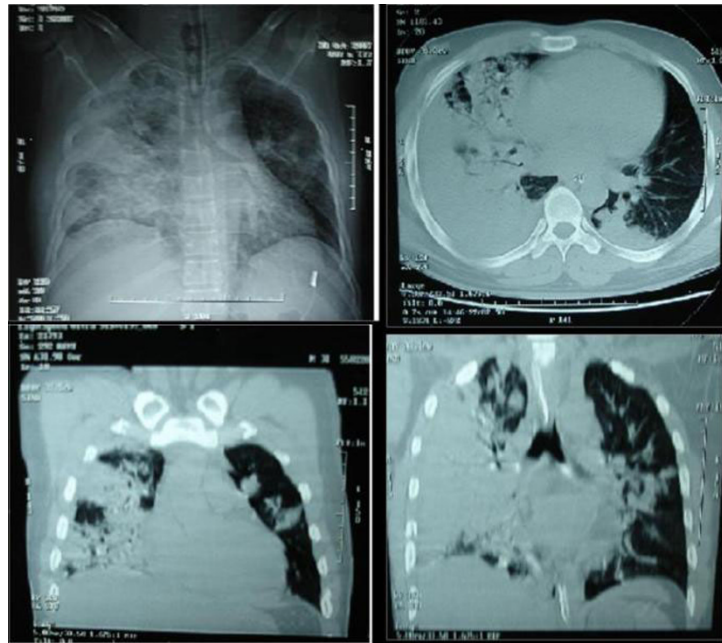
Figure 3 CT thorax showing features suggestive of necrotizing pneumonia.

beyond the confines of the hospital. In addition, respiratory infections are a common cause of rhabdomyolysis, which should be considered with a high index of suspicion in order to initiate timely intervention.