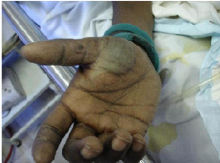
Figure 1 Abscess over the thenar eminence of the right hand.

with ARDS, a CT thorax was ordered for the patient, which revealed necrotizing pneumonia [Figure 3]. Serial Chest X-Rays were taken there after to monitor the patient.