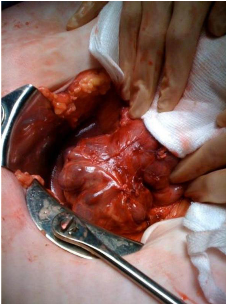
Figure 4 This is an intra-operative image showing large, thin walled, diverticulae in the duodenum with bowel contents visible through the wall of the diverticulae.

of a familial pattern. Ehlers Danlos syndrome type IV has two main phenotypes with the 'acrogeric' form having a much worse prognosis than the 'ecchymotic' form. Our case was likely the ecchymotic form type IV. The acrogeric phenotype tends to have large eyes, peaked nose and premature ageing of the hands [1]. This phenotype includes the more serious and lethal sequelae of vascular rupture of the aorta in later life. It can present in many ways but the commonest is with gastrointestinal (GI) side effects. The two main complications include GI bleeding and perforation. Of the perforations, most of these occur within the colon, more specifically the recto-sigmoid junction. A study performed by Sigurdson et al revealed that in-vitro electromyographic studies of the colonic tissue suggested a possible link between abnormal myogenic activity and colonic