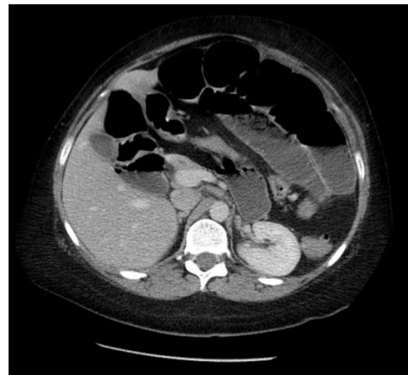
Figure 2 This is a CT Scan showing malrotated large loopy colon and distended small bowel, taken one day before operation performed on the patient.

bruising tendency, with mild difficulty in using her hands since childhood with occasional finger locking and decreased hand strength. There was no significant family history and none of connective tissue disorders.