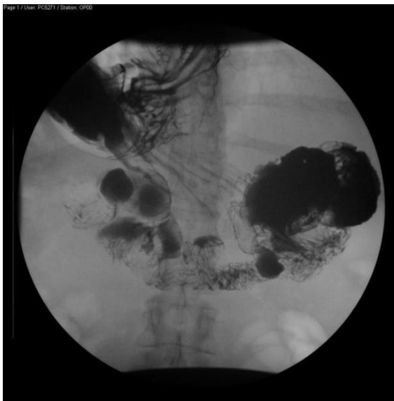
Figure 1 This is a gastrograffin meal highlighting diverticulae in the duodenum, performed six weeks prior to admission for further evaluation of oesophagitis.