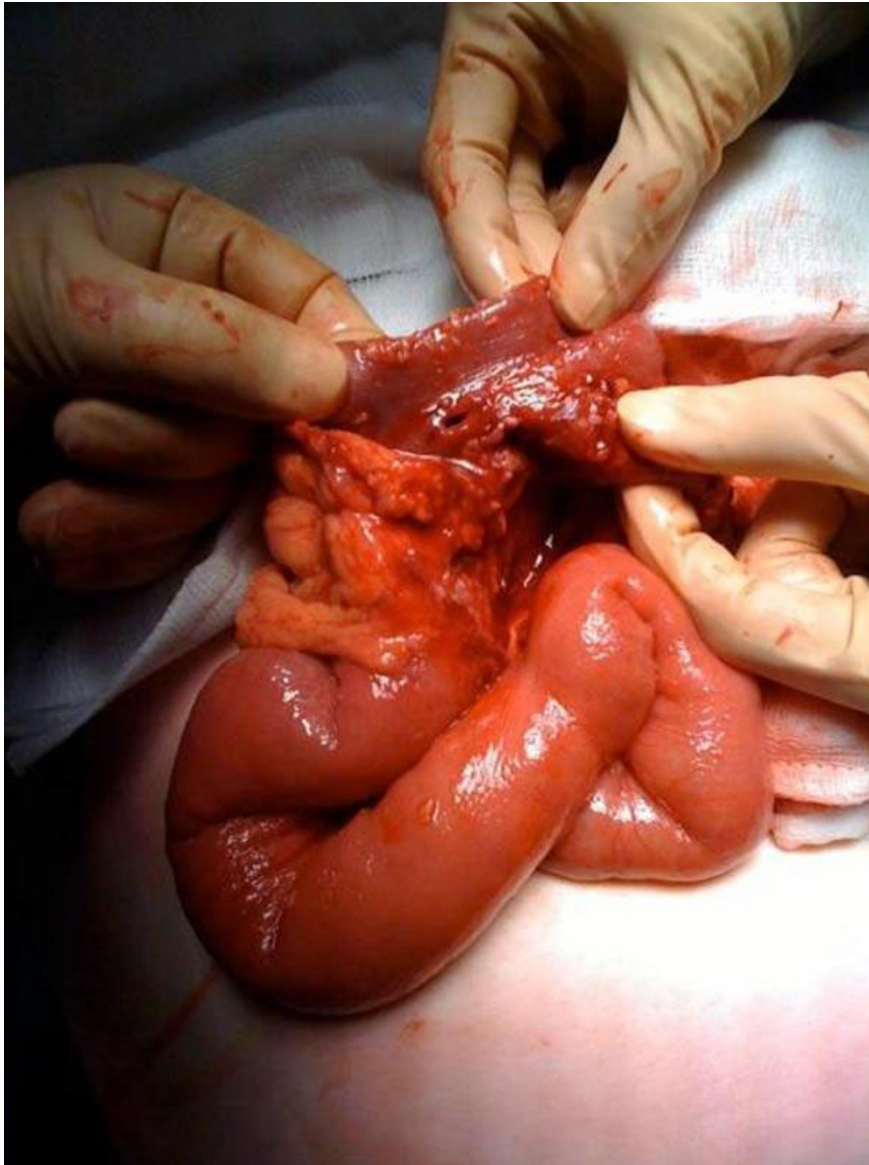
Figure 5 This is an intra-operative image showing the perforations were in the segment of distal ileum with no diverticulae.

case reports of tissue friability include rectal bleeding on passing of hard motions. Several patients in the survey reported rectal bleeding following the passage of hard stools [3]. Tissue friability is also noted by many operating surgeons on patients with Ehlers Danlos syndrome due to the collagen deficiency. With many intestinal operations serosal tears occur on minimal handling and so a minimally invasive/minimal handling approach is advised when working with the bowel.