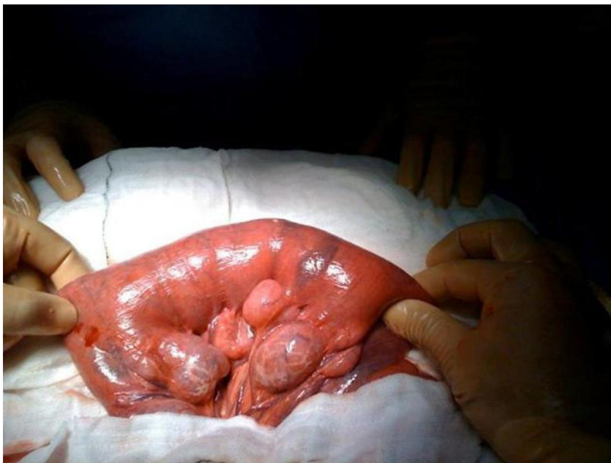
Figure 6 This is an intra-operative image showing proximal ileum and jejunum showing large, thin walled diverticulae, which were fluid filled.

therefore making stapled anastomosis unreliable and hand suture technique more favourable.