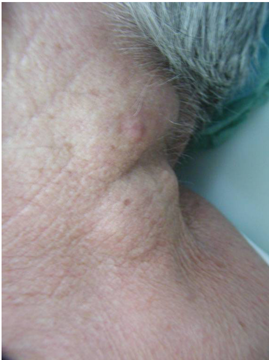
Figure 1 The lesion on the left side of the patient's neck before excision.

Histology showed a low grade nodular malignant mesenchymal neoplasm consisting of perpendicularly arranged fascicles of spindle cells with eosinophilic fibrillary cytoplasm, scattered pleomorphic nuclei and irregular mitosis with a rate of 6 to 8 per 10 high-power-fields (Fig. 3). The lesion was localized in the subcutaneous tissue, while medially it was in contact with striated muscle without infiltrating it. On immunohistochemical staining, the tumor expressed focal