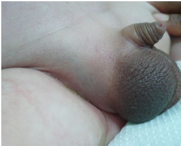
Figure 1 Swelling and erythematous right hemiscrotum.

objective the increased vascular flow and the inhomogeneous echogenicity of the epididymis and the testis [3].